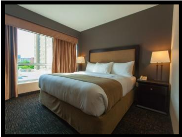
Executive Suite $185.00

Our spacious two room Executive suites offer a city view and are located on the top three floors of the hotel. Our Executive Suites offer warm and spacious living conditions, which feature a Park Town Dream Pullout couch and fireplace.