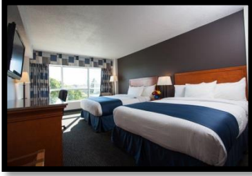
Standard Two Queen $135.00

Enjoy your stay with us in one of our entry-level rooms. Our spacious Double Queen rooms include two queen sized Park Town Dream beds. Our Double Queen rooms are Pet Friendly.