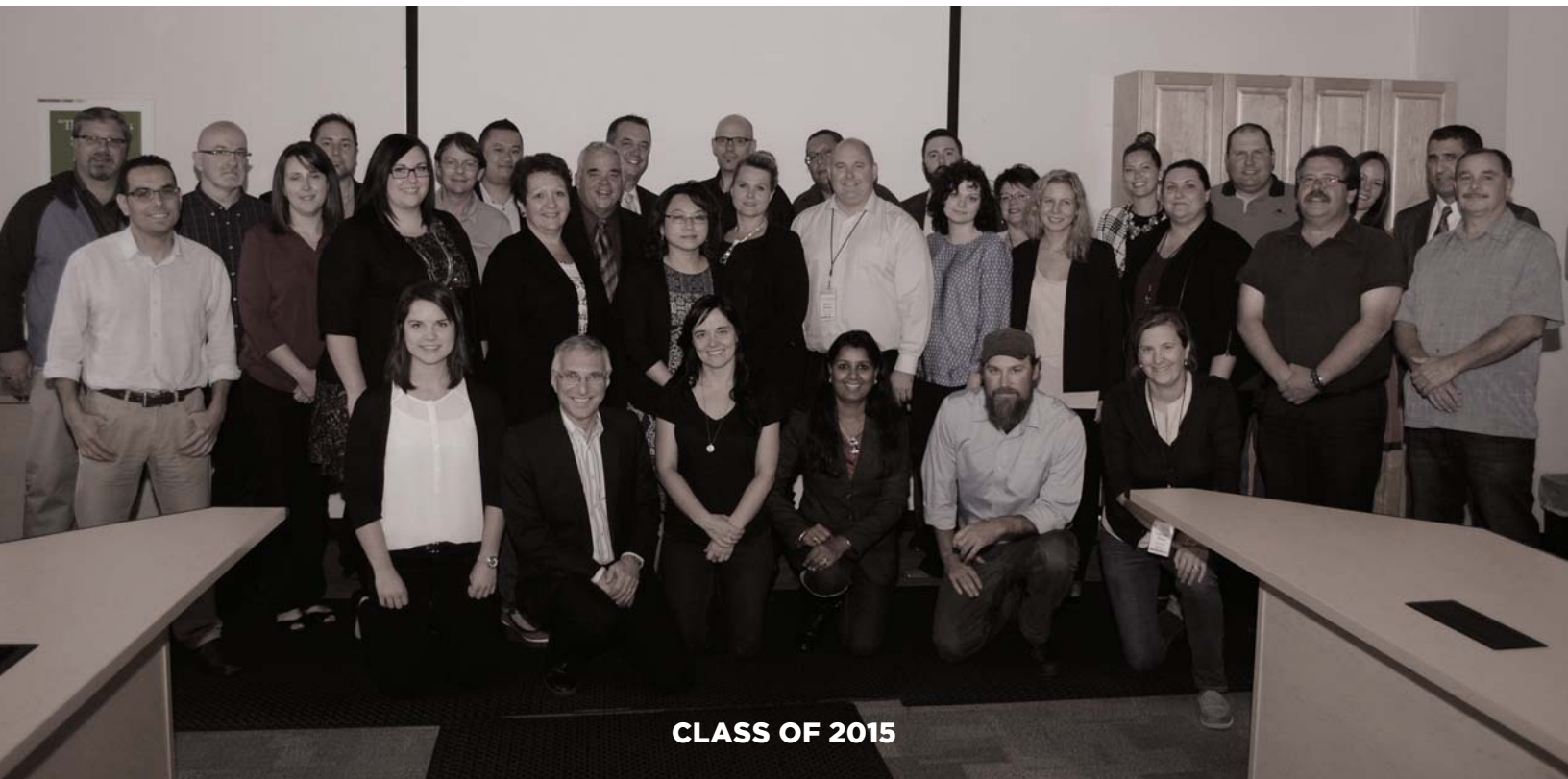
CLASS OF 2015

Saskatchewan Teachers' Federation Saskatoon Police Service SGEU Sun Country Health Region UFCW Local 1400 University of Alberta University of Northern British Columbia University of Saskatchewan Westmoreland Coal Company